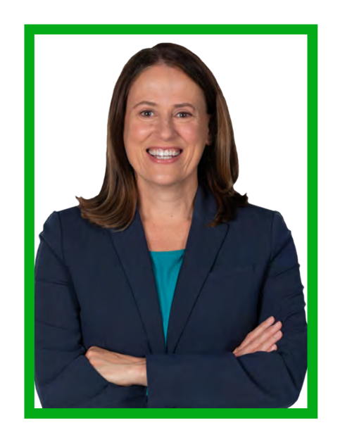
DEMOCRAT - DES MOINES