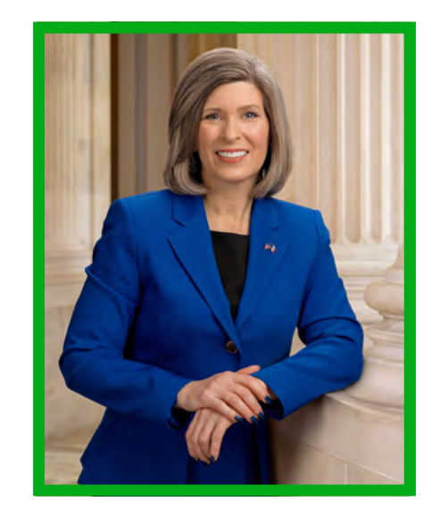
REPUBLICAN - RED OAK