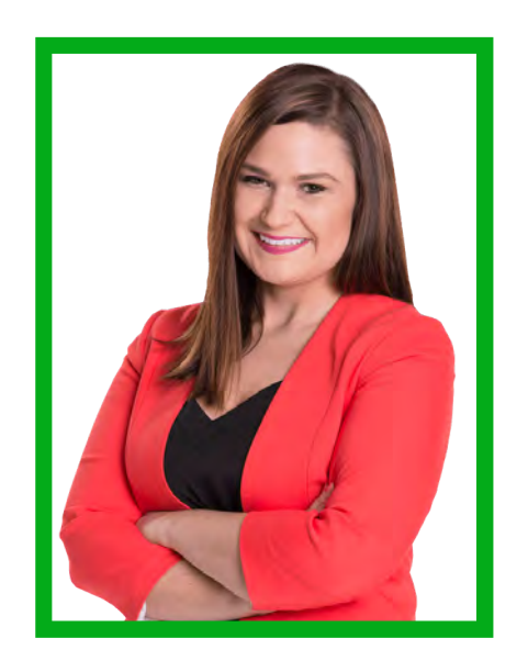
DEMOCRAT - CEDAR RAPIDS